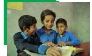
Little learners striving for a better future