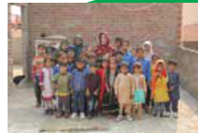
A safe space for better learning outcomes

Pakistan's first Farm Daycare Center for children of women agricultural workers was constructed by PepsiCo in Fatehpur, Kasur. It provides a secure space for children of female agricultural workers who work on PepsiCo partner farms in the area. It fosters and supports economic inclusion and empowerment of women. The facility, managed by IRM, includes an engaging playroom with educational tools and an outdoor area featuring swings and slides made from recycled plastic, sourced from Green Earth Recycling.